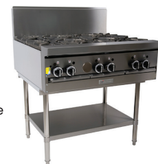
GF36-6T pictured with optional stand

Large easy-to-use control knobs sit flush to the 'plate rail' and the unit can sit on top of the optional stainless steel stand with storage shelf.